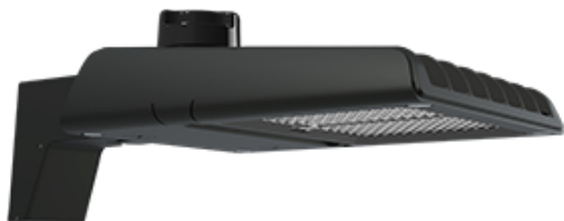
Color: Black Weight: 11.2 lbs