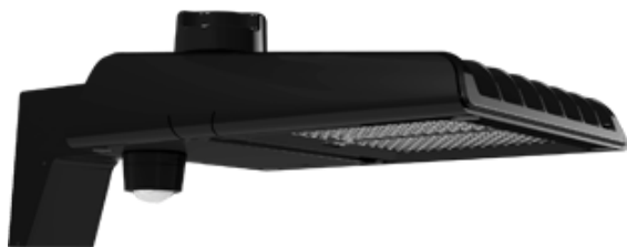
Color: Black Weight: 11.2 lbs