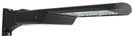
Color: Bronze Weight: 8.8 lbs