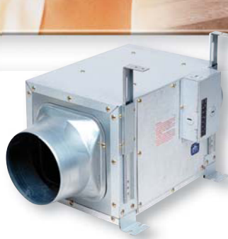
FV-20NLF1 240 CFM 6" Duct