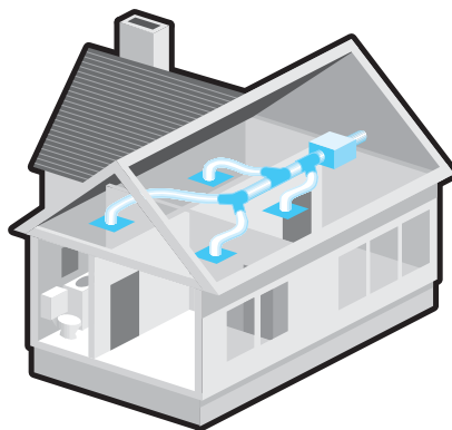
Continuous (low rate) ventilation with multiple inlets through the home for indoor air quality improvement