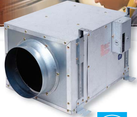
FV-40NLF1 440 CFM 8" Duct