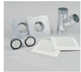
Double Inlet Kit