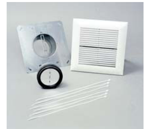
Single Inlet Kit