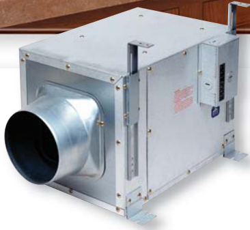
FV-30NLF1 340 CFM 6" Duct