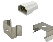
Hardware Kit (included w/fixture)

NULSA-206-90 6" NULSA-212-90 12" NULSA-218-90 18" Used to join NULS-LED fixtures together at a 90° angle or connect to junction box (NULSA-JBOX).