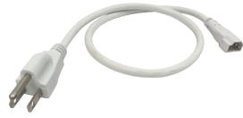
6' 3-Wire Cord and Plug

Used to power NULS-LED series using Jumper Cables or NULSA-272-HWC Hardwire Connector. (Not UL Listed)