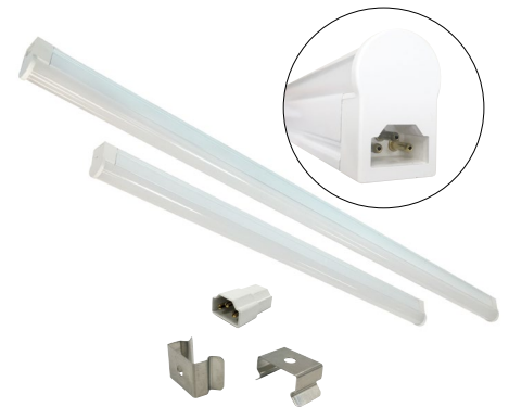
Mounting brackets and coupler are included (NULSA-MTGKIT)