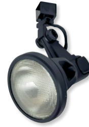
NTH-133B Black Belgium™ Front Loading Gimbal