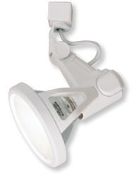
NTH-133W White Belgium™ Front Loading Gimbal