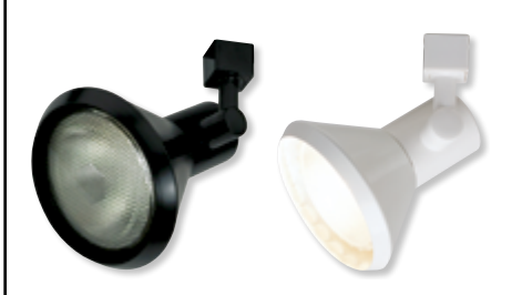
NTH-126B Black Cone