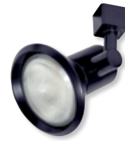
NTH-125B Black Cone