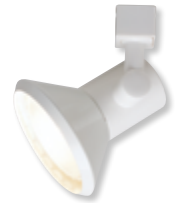
NTH-125W White Cone