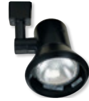
NTH-124B Black Cone