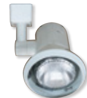
NTH-124W White Cone