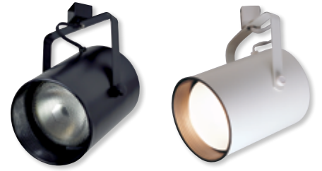
NTH-113B Black Flatback Cylinder with Black Baffle