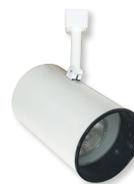
NTH-101W/A White Finish