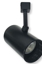
NTH-101B/A Black Finish