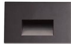
NSW-740DBZ Deep Bronze