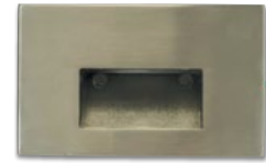
NSW-740BN Brushed Nickel