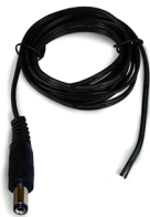
NALTL-10 / NALTL-30 Power Line Connector

NPSU-60W/24 / NPSU-96W/24 24V Class 2 Dimmable Driver (Phase, 0-10V & PWM dimming)