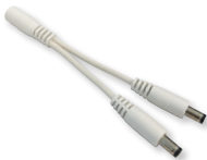
NATL-302W Power Line Splitter