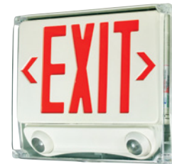
NEX-730-LED/R & NEG-60

Exit & Emergency Combo with Wet Location Enclosure