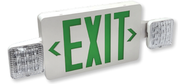
NEX-712-LED/G Green Letters