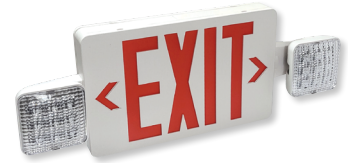
NEX-712-LED/R Red Letters