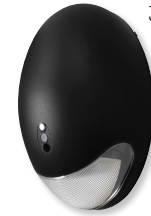
NE-921LEDBCC Black Finish

Three position sliding switch 3000K / 4000K / 5000K