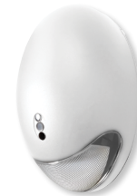
NE-921LEDWCC White Finish