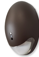
NE-921LEDBZCC Bronze Finish