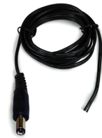
NALTL-10 / NALTL-30 Power Line Connector (10' included)

24V Constant Voltage Dimmable Hardwire Electronic Driver