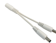
NATL-302W Power Line Splitter