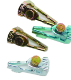
156T1978A Extra/replacement trippers 1 ON and 1 OFF