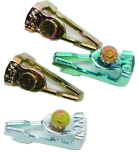
156T1978AMX 1 Set of ON/OFF Trippers for T100, T7000, and WH40