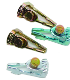
156T1978AMX 1 Set of ON/OFF Trippers for T100, T7000, and WH40