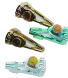
156T1978A Extra/replacement trippers 1 ON and 1 OFF