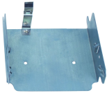
22T338GR Mounting Bracket for Intermatic Standardized Timer Mechanisms