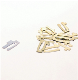
156T1950A Set of 12 Trippers for T1900, T2000, C8800, R8800 and T8800 Series