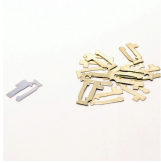
156T1950A Set of 12 Trippers for T1900, T2000, C8800, R8800 and T8800 Series