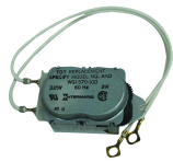
WG1570-10D 125 VAC, 60 Hz Motor for T101, T103, T105