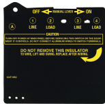
124T1952 Insulator for Double-Pole Time Switch (T103, T104, T105, T173, T174, T175, T176, T185, WH40)