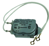
WG1570-10DMX 125 VAC, 60 Hz Motor for T101, T103, T105