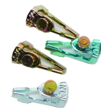
156T1978AD12 12 Pack of 156T1978A Trippers for T100, T7000, and WH40