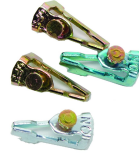
156T1978AD12 12 Pack of 156T1978A Trippers for T100, T7000, and WH40