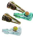
156T1978A Extra/replacement trippers 1 ON and 1 OFF