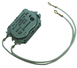
WG1573-10DMX 208-277 VAC, 60 Hz Motor for T102, T104, T106, T172, T174, WH40