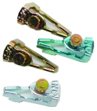
156T1978AMX 1 Set of ON/OFF Trippers for T100, T7000, and WH40