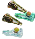
156T1978AD12 12 Pack of 156T1978A Trippers for T100, T7000, and WH40