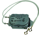
WG1570-10D 125 VAC, 60 Hz Motor for T101, T103, T105