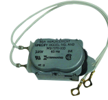
WG1570-10DMX 125 VAC, 60 Hz Motor for T101, T103, T105