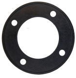
K121-GSKT Locking Type Receptacle Gasket