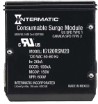
IG120RSM20 Replacement IMODULE® for IG2280 Series