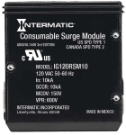
IG120RSM10K IMODULE® Replacement Module for SMART GUARD®