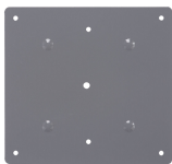
IG1240FMP33 Flush Mount Kit for IG1200RC3 and IG1240RC3