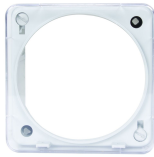
FM-FU FM1 Flush Mount Housing Kit