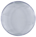
DC-FME-A Clear Dust Cover for Electronic Panel Mount Timers