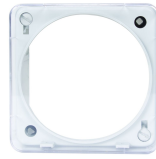
FM-FU FM1 Flush Mount Housing Kit