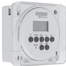
FM1D14E (flush mounting)