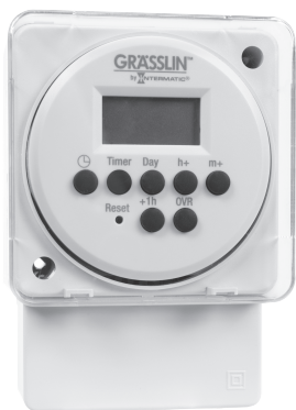
FM1D14A (surface mounting)