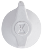
146MT577 Knob-Wall Switch FF Series - White