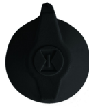
146MT579 Knob-Wall Switch FF Series - Black