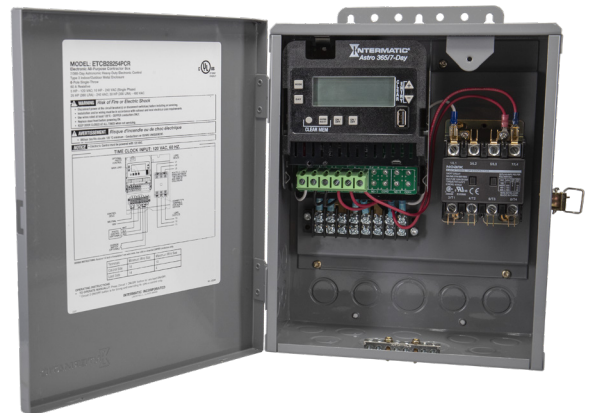
Shown in indoor/outdoor lockable metal enclosure with deadfront cover removed

Contractor box features a built-in time switch, a 4-Pole contactor, a remote input for a photocontrol, input location for a surge device, as well as an input for a standard switch to be used. The built-in time clock features an LCD and panel-mounted control buttons to set, review, and monitor the time switch functions, including setting date and time, schedule creation, enabling or disabling Daylight Saving Time (DST) and configuring DST switchover dates. Follow these instructions to complete the installation and programming of the ETCB28254PCR 4-Pole Lighting Contractor Box.